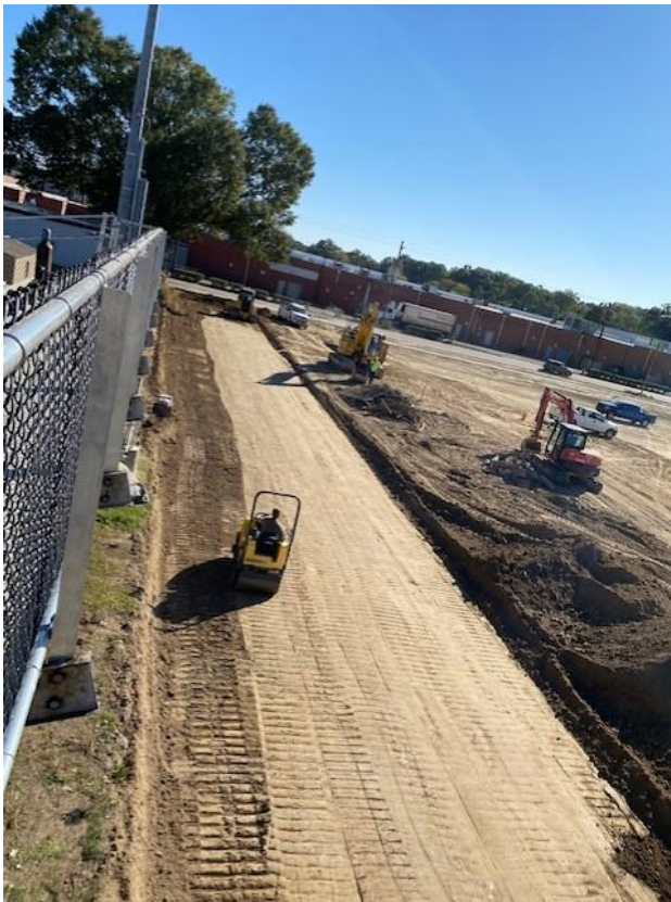
Excavation started in October