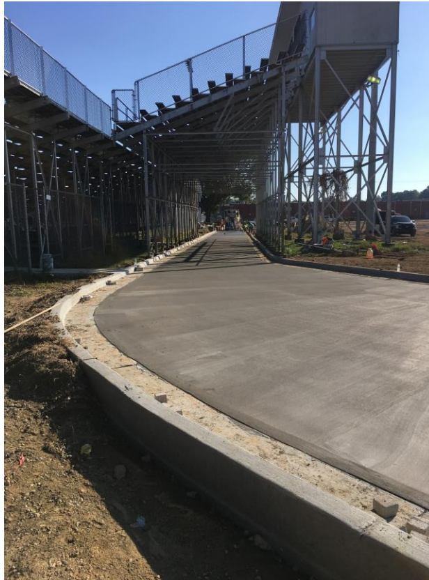
Concrete drive poured in November